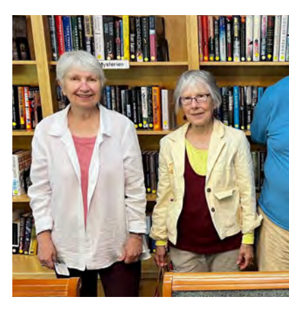
Loomis Village Resident Association