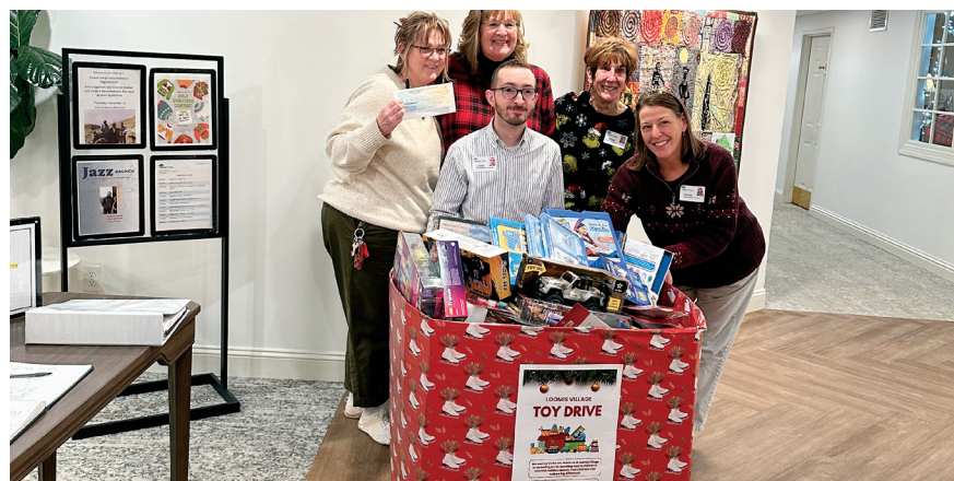
Loomis Village Team Members proudly celebrate together at the conclusion of a successful holiday toy and fund drive to support local children and families in need.