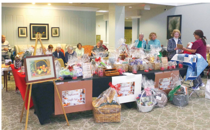
The Loomis Lakeside at Reeds Landing residents are ready to welcome hundreds of attendees from near and far to the annual Craft Fair fundraiser to support the Reeds Landing Philanthropic Fund for resident and team member financial assistance.