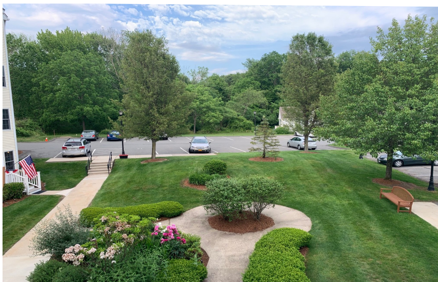
Green Space at Loomis Village

hungry, so arrive ready to explore what South Hadley has to offer. What will it be tonight: maybe Lo Mein from New Main Moon Café or some Akara from Duro's West African Cuisine? In the Commons, you'll find plenty of choices for global cuisine and a wide selection of bar and grill establishments. Be sure to visit Thirsty Mind Coffee and Wine, morning or night, where you can sip a latte or interesting vintage while enjoying the ambiance.