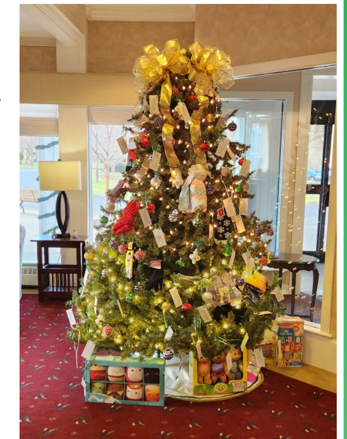
Last year's giving tree at Applewood helped more than 75 children.